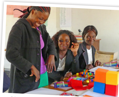
Nsobe School teachers learning to use the new math materials.