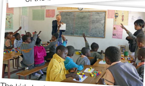
The kids had so much fun learning to use the math 'games' that they stayed inside at recess the next day to play math! Did that ever happen to you in Canada?