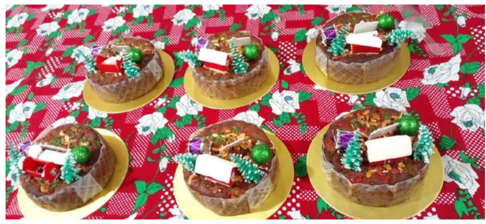
Sweet fruit cakes in Dhaka

Naturally this week its been all about Santa and Christmas. The children dressed up, were given treats and gifts then a special meal. Most of the time these meals are donated with a sponsor choosing a meal that contains ingredients we aren't able to afford to give them.