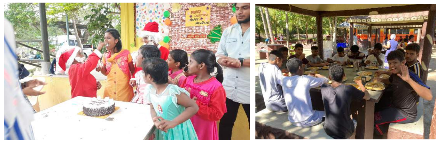
Enjoying cake in India

Our goals for next year will be expanding our physio and occupational therapy sections, adding some new papercard patterns and changing all the wheel chairs that our children use daily. We are looking to expand our outreach in Dhaka and assist our community in India.